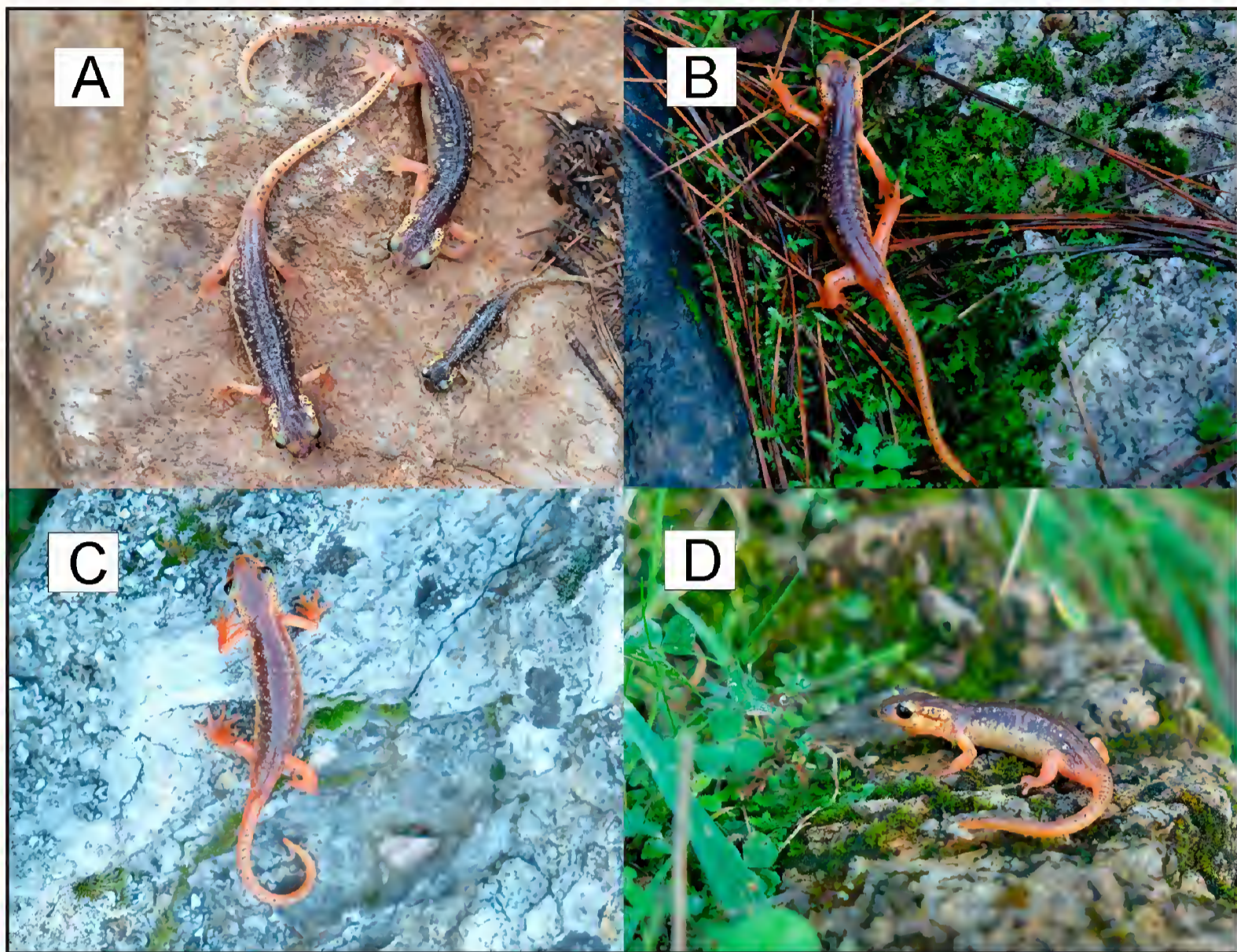
Fig. 3. Specimens from new sites. A. the right-side female, the middle male, left side juvenile from Arıcılar [1]; B. A male from Turunç [2]; C. A male from Selimiye [4] D. A juvenile from Söğüt köyü [5].

this situation with three new recognized species ( L. irfani , L. arikani , and L. yehudahi (Göçmen et al. 2011; Göçmen and Akman 2012) being changed to subspecies of L. billae (Veith et al. 2016) over the last six years. The species has also suffered due to scientific collection for taxonomic studies and the pet trade, reducing population sizes (UNEP-WCMC 2008). We hope that future faunal and taxonomic studies on Lycian salamanders will be designed to involve low/no specimen collections. All